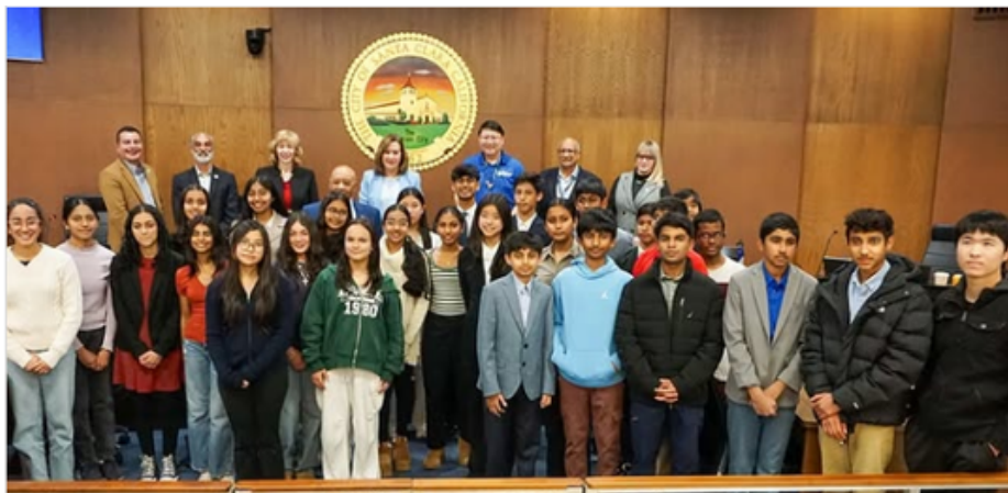
Santa Clara City Council student recognition