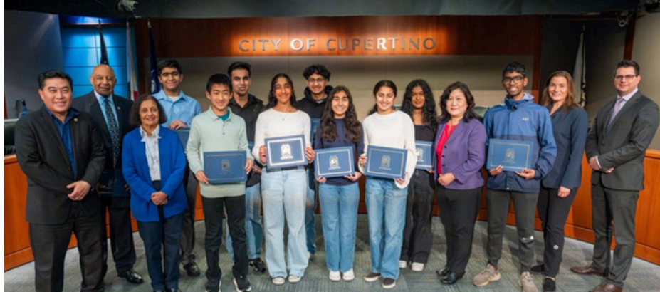
Cupertino City Council student recognition