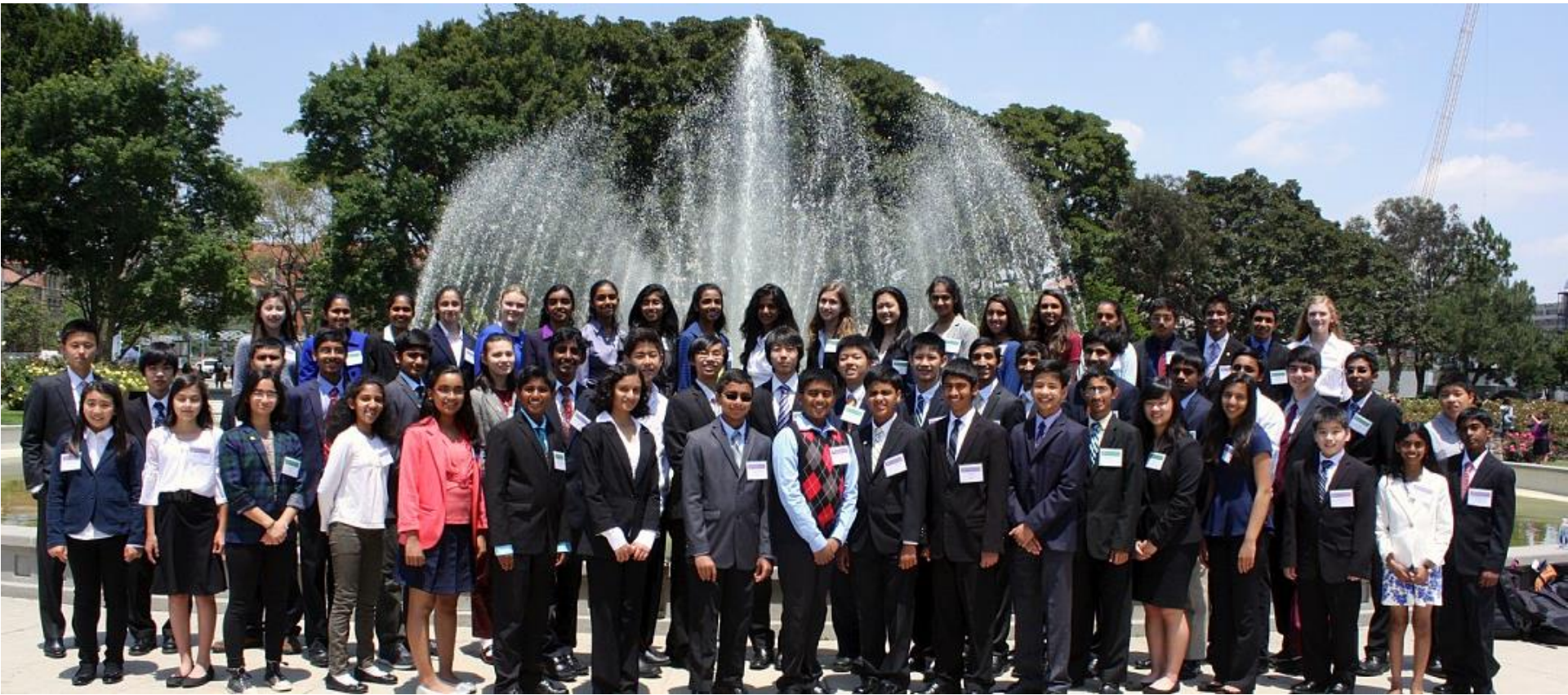
Synopsys Championship Participants