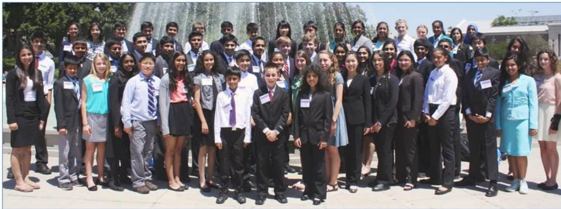
Synopsis Championship participants at the 2014 California State Science Fair in Los Angeles, April 28.